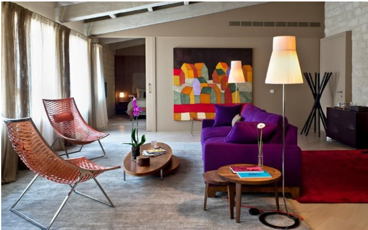
The Mercer is a peaceful oasis in the heart of the Old City.

An insider's guide to the Barcelona's top boutique hotels, including the best for rooftop pools, hip bars, Michelin-starred restaurants and stylish bedrooms, in areas including La Rambla, the Barri Gòtic (gothic quarter), El Born and the Passeig de Gràcia.